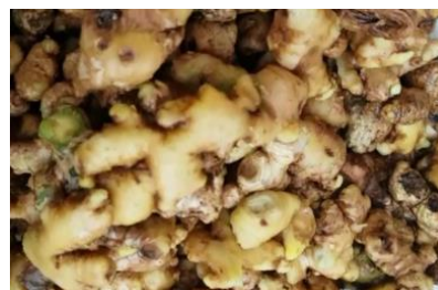
Figure 3 Empon-empon that has been cleaned