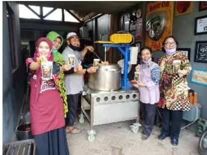
Figure 7 JAMULACANG INSTAN completed in production