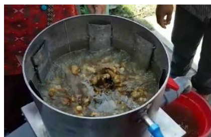
Figure 2 The process of washing and stripping the empon-empon

The activity of the "Instant Jamulacang" production process by the PKM program implementation team can be seen in the photo of the following activity: