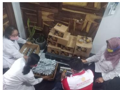
Figure 9 Packaging Process