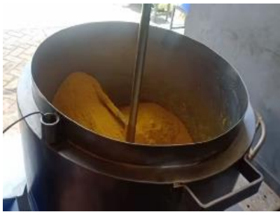
Figure 6 Extraction Process “JAMULACANG INSTAN”