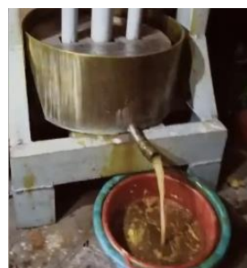
Figure 5 Pressing/squeezing the empon-empon (Ginger)