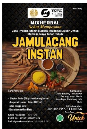
Figure 8 Wrap Packaging “JAMULACANG INSTAN”