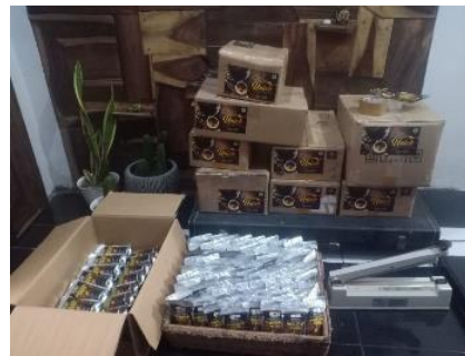
Figure 10 JAMULACANG INSTAN Finish Packed