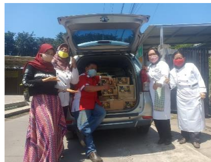
Figure 11 Delivery JAMULACANG INSTAN to LPPM Unesa